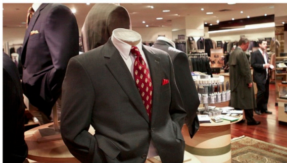
Men's Wearhouse Store

Each of these options is a personal and stylistic choice, please see a sales representative for more assistance.